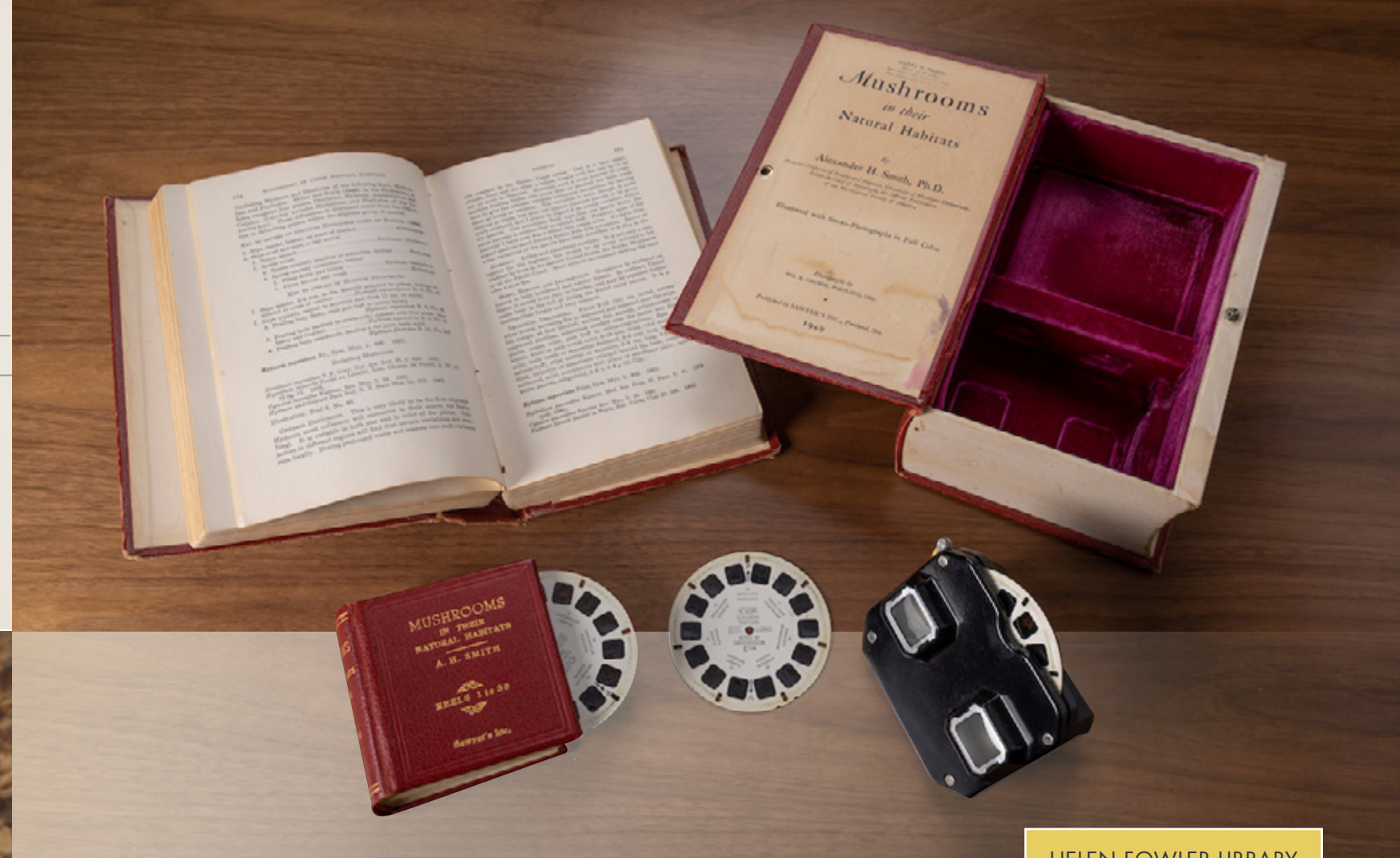
HELEN FOWLER LIBRARY