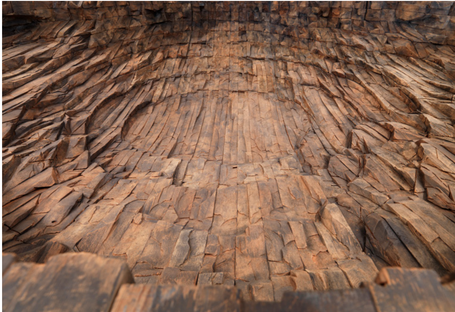
Ursula von Rydingsvard, Ocean Floor (detail), cedar, graphite, and intestines, 1996, 36 x 156 x 132 inches. Artwork © Ursula von Rydingsvard.